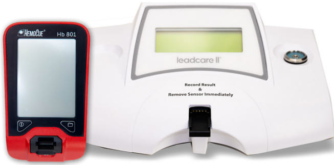
Hb 801 System HEMOcUE